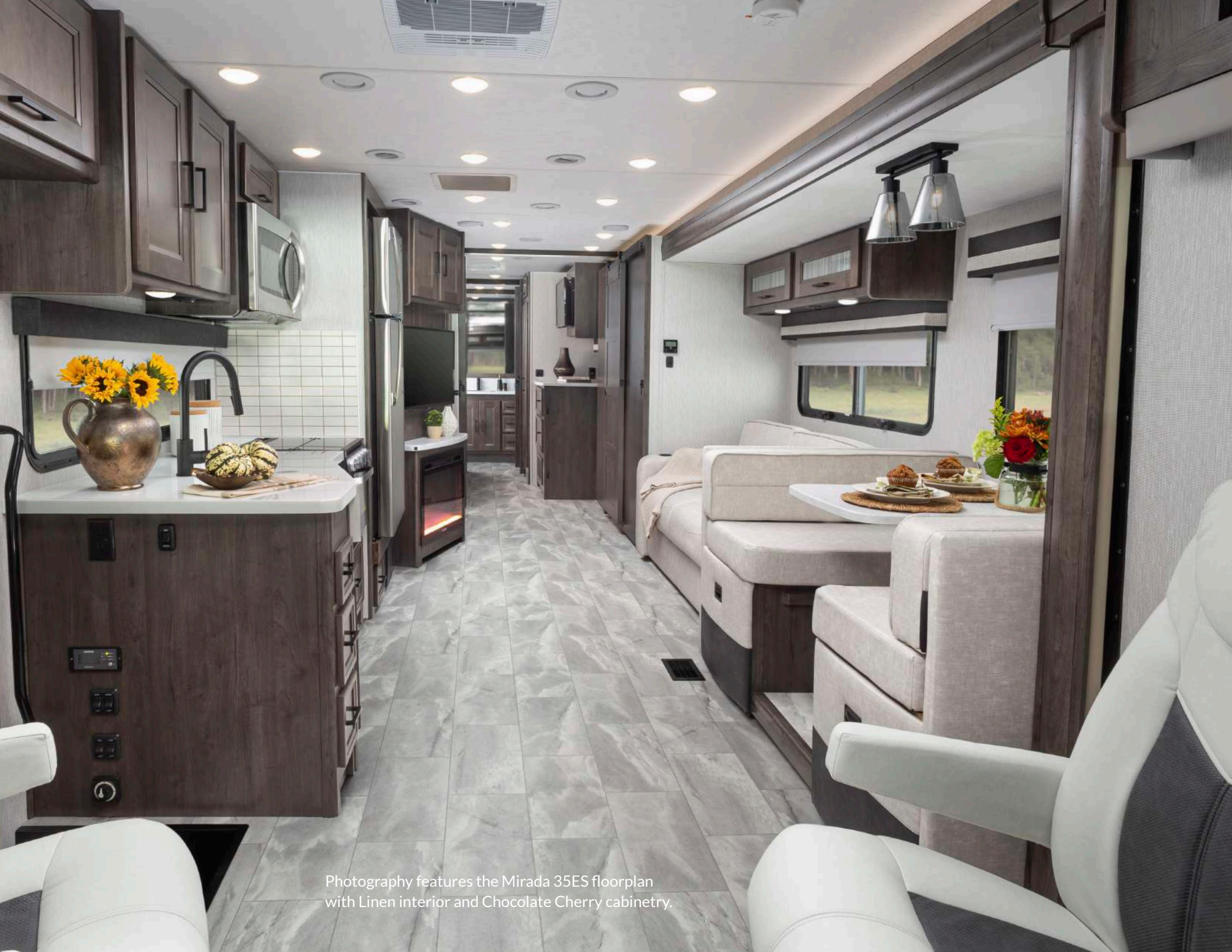
Photography features the Mirada 35ES floorplan with Linen interior and Chocolate Cherry cabinetry.