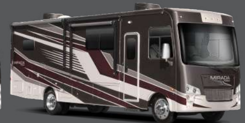
Full Body Paint – Scarlet