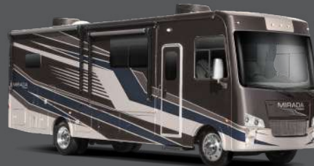
Full Body Paint – Glaucous