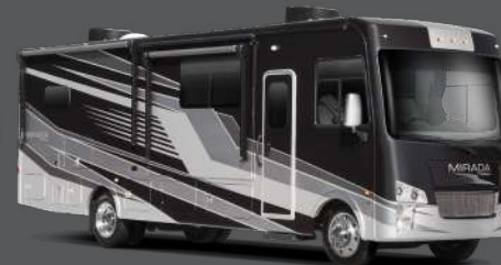
Full Body Paint – Graphite